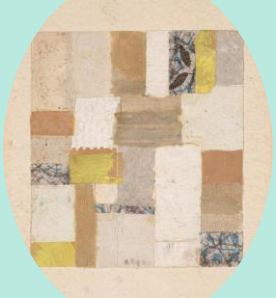
Anne Ryan's Untitled