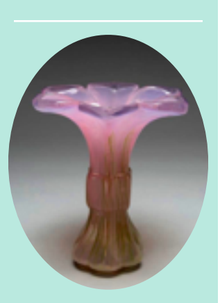
McNay Connection Emile Gallé, <u>Form</u> <u>Vase</u> ca. 1900.