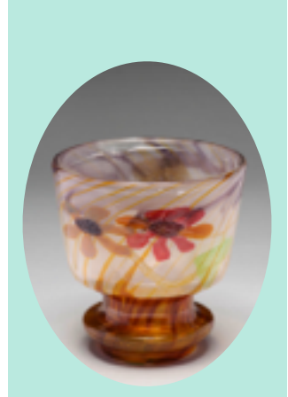
McNay Connection Emile Gallé, <u>Vase</u> ca. 1900.

Emile Gallé was a French artist and designer known for his innovation in the Art Nouveau Movement, popular around the late 19th early 20th century. Gallé applied designs inspired by nature and used lots of vibrant colors in the glass pieces he created. There are some simple contemporary ways to create our own glass artwork inspired by Gallé using everyday materials.