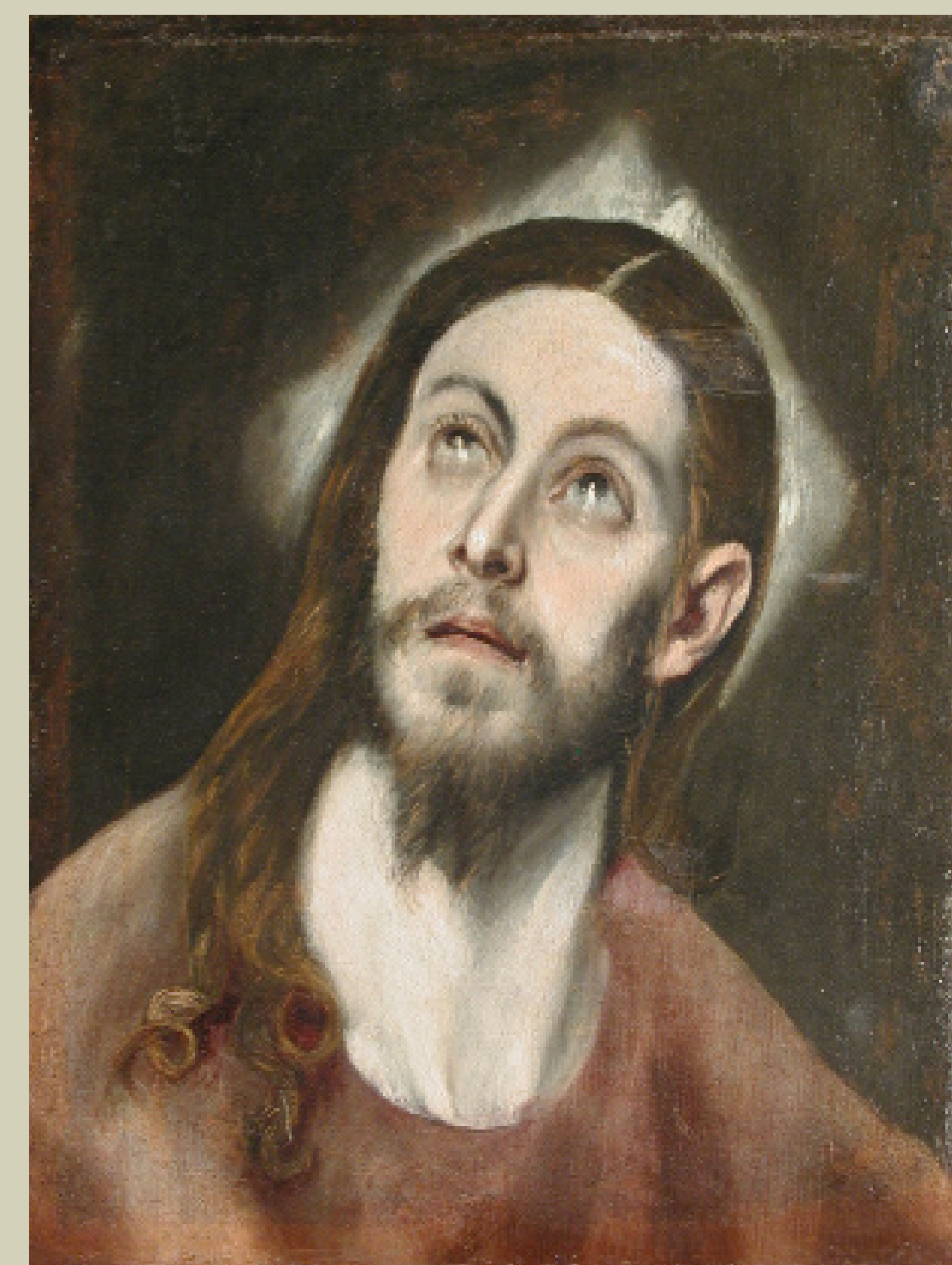
The McNay's Head of Christ before conservation.

In both the McNay's Head of Christ and Jesus's face in The Disrobing of Christ , the figure looks up to the viewer's left with immense, moist eyes. The McNay's painting echoes the delicate features of Christ's face, his powerful neck, and the dark red tunic in The Disrobing of Christ . In his early years in Toledo, El Greco developed an artistic vocabulary that he would further refine throughout his career. Although no concrete evidence exists linking the McNay's Head of Christ and Toledo cathedral's The Disrobing of Christ , the similarities are striking.