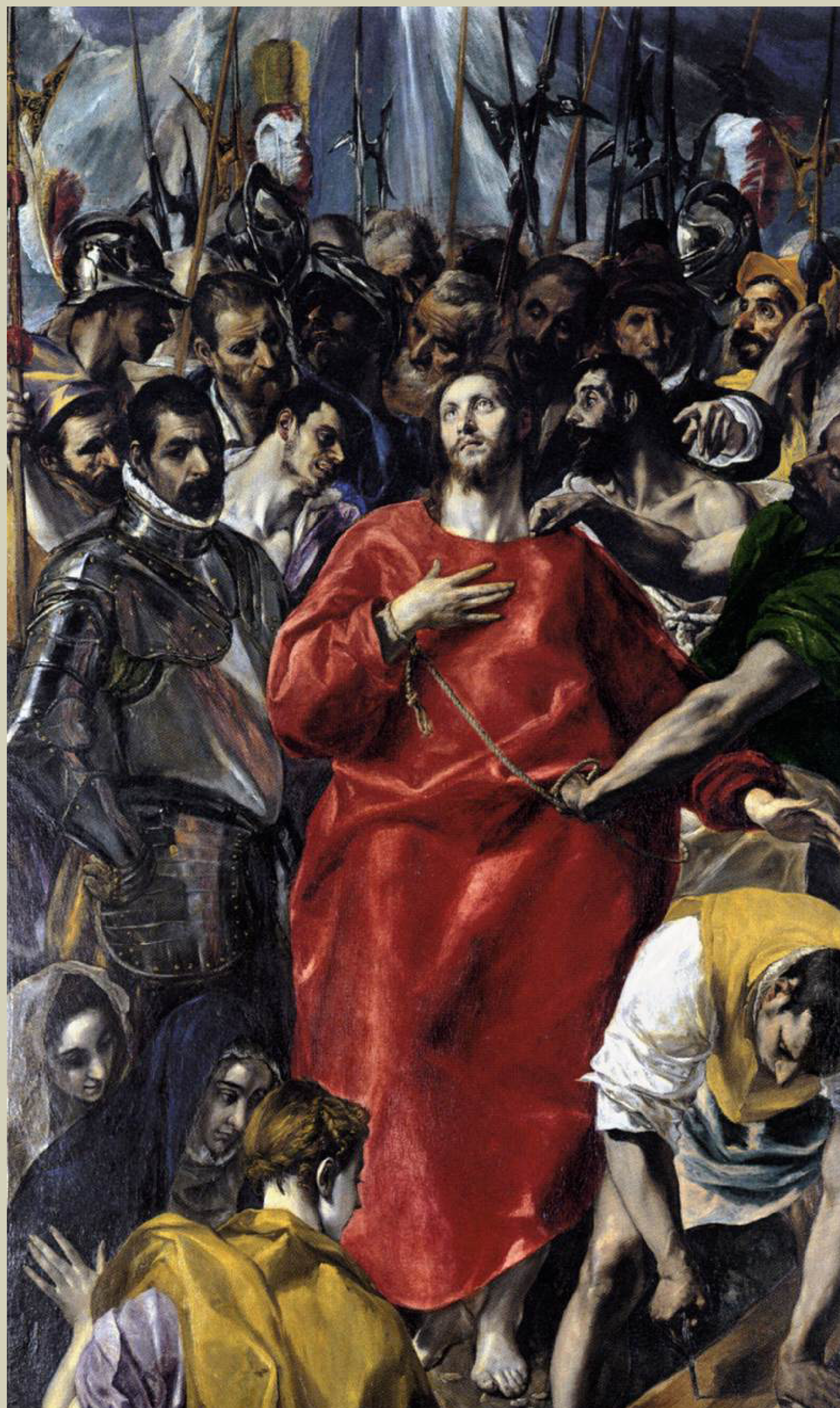
El Greco (DoménikosTheotokópoulos), El Espolio (The Disrobing of Christ) , 1577–79. Oil on canvas, Toledo Cathedral, Spain.

Scholars have proposed several theories about why El Greco painted the McNay's Head of Christ . One expert suggests that the work was intended to hang with an image of Our Lady of Sorrows (Mater Dolorosa) , a common pairing in 16th-century Catholic Spain. Others think that an individual in Toledo, Spain, admired other El Greco works and commissioned the painting as a personal devotional piece. Still others hypothesize that the work is a simplified version of the central figure's face in El Greco's earlier masterpiece The Disrobing of Christ , which was commissioned in 1577 for the Toledo cathedral and completed in 1579.