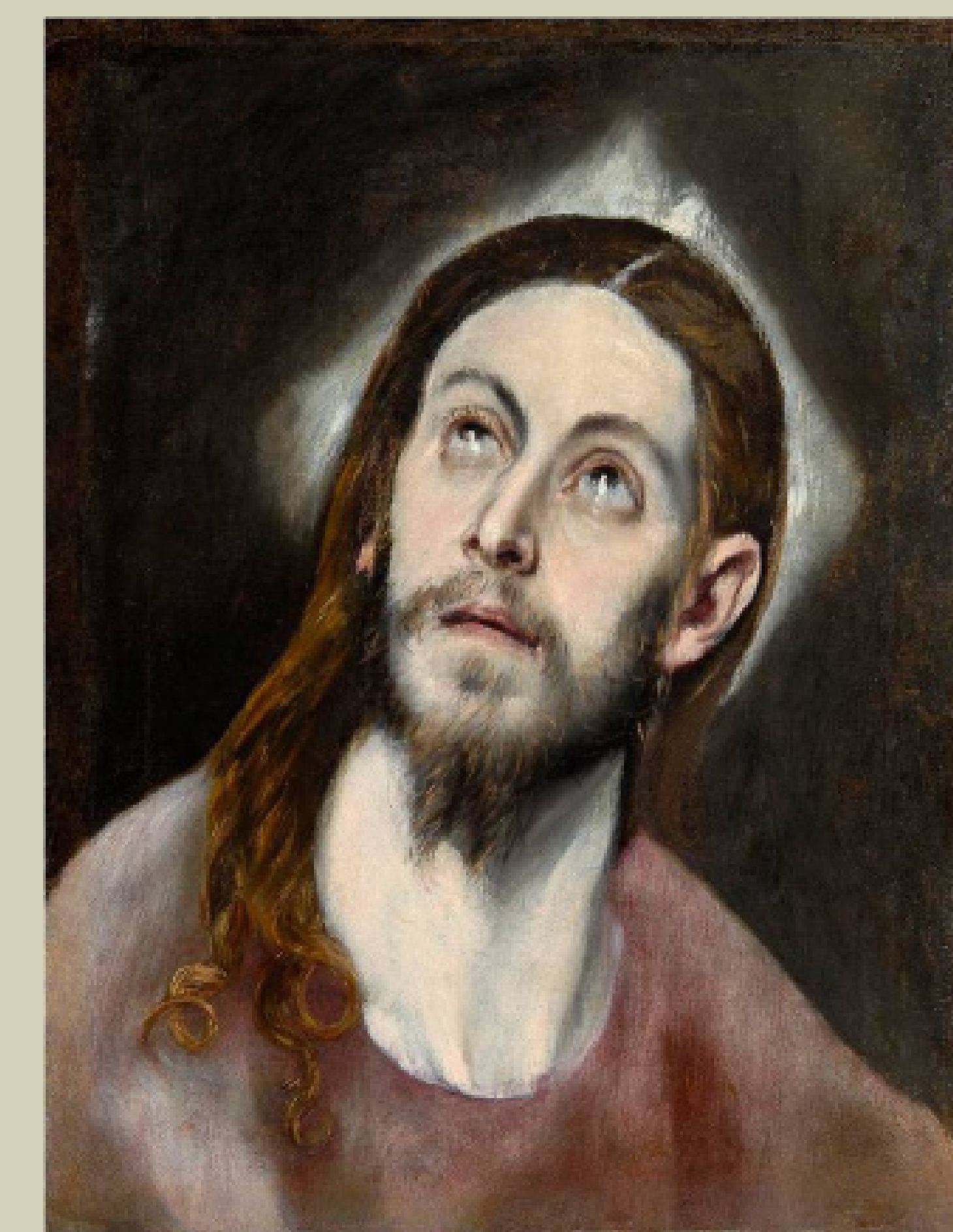
The McNay's Head of Christ after conservation.